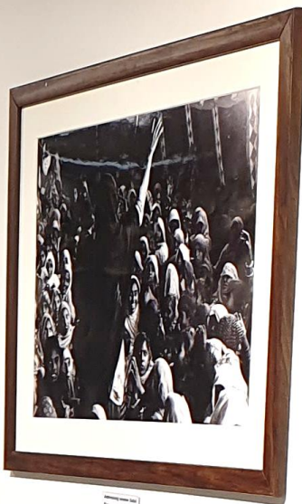
A crowd of people at a public event