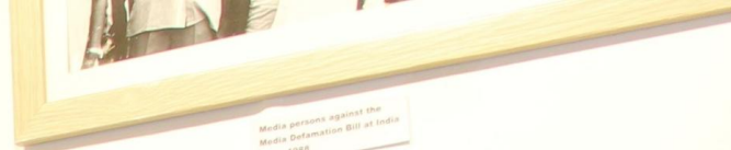
Media persons against the Media Defamation Bill at India Gate, 1988