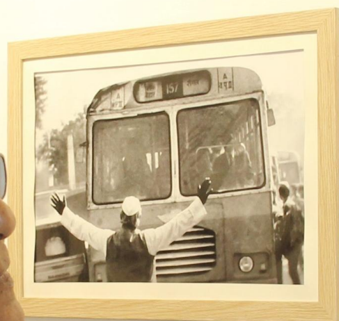
A Congress (I) worker trying to halt a STC bus outside New Delhi Railway Station