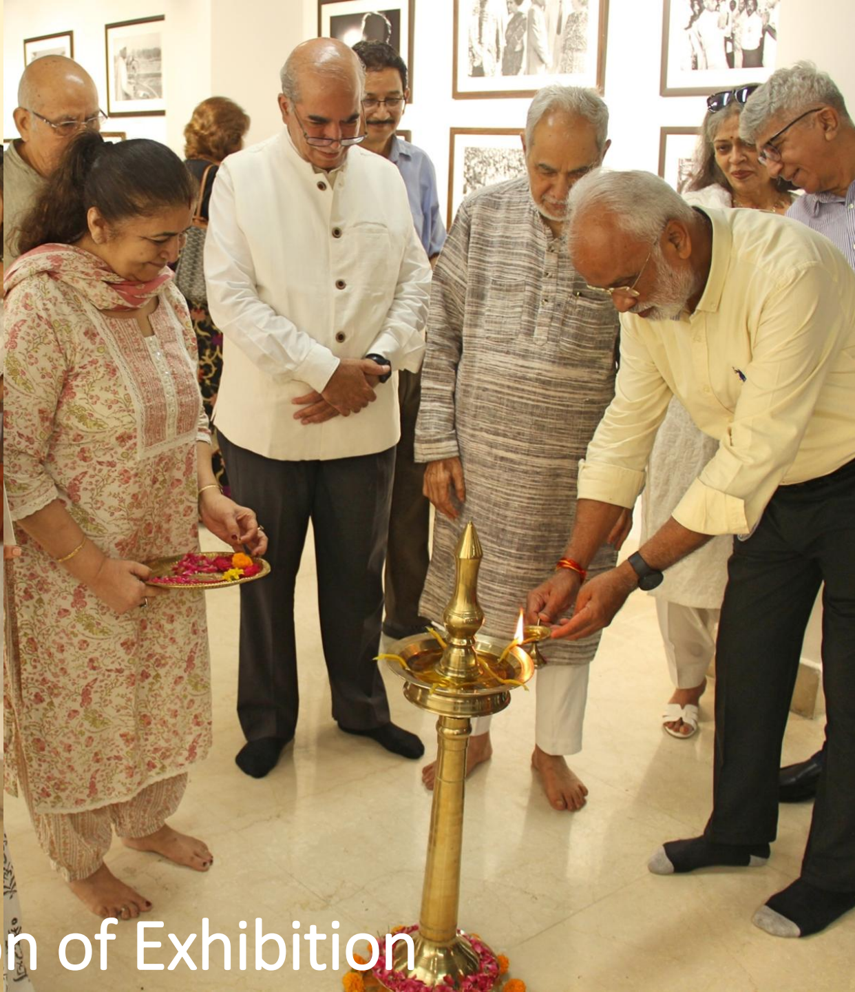
Inauguration of Exhibition