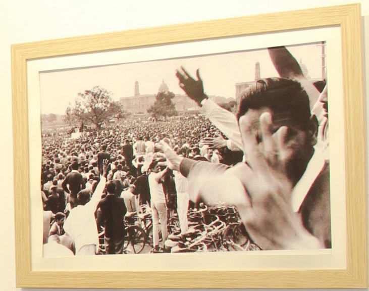
Protest at the Boat Club