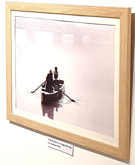
A small boat on a body of water