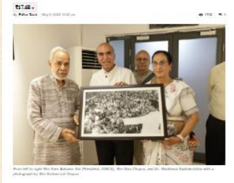
Roshan Lal Chopra's Photographic Odyssey: A Timeless Window into India's Past