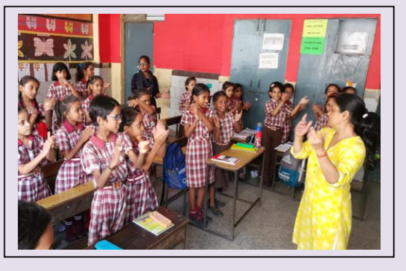
April 2023 to March 2024