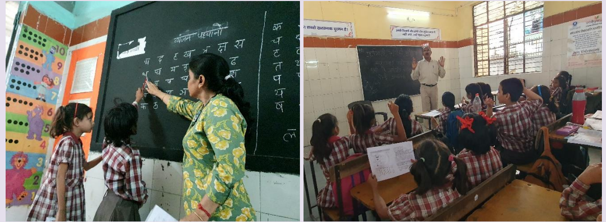
Accordingly, the school facilitators provided academic support in standards 3<sup>rd</sup> to 5<sup>th</sup>.

The two school facilitators from DISHA provided academic support to students in the resource centres. In the schools, the class-wise lesson plans were discussed with the class teachers and modified as per the weekly teaching plans.